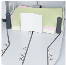
The criss-cross stacking feature allows easy set separation.