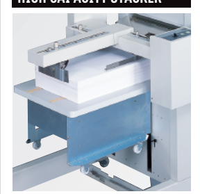
The high capacity stacker can stack up to 3,200 collated sheets (straight or offset).