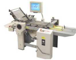
Baum 20 w/ i-fold

To learn about the current specials go to the Baumfolder web site www.baumfolder.com or call Baumfolder parts at 800-543-6107.