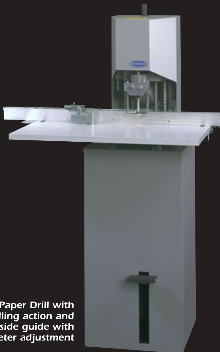
JF Model Paper Drill with foot pedal drilling action and automatic trip side guide with micrometer adjustment