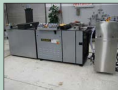
2007 Olec 19" UV Roller Coater 19" Olec UV Roller Coater Model DMC 19HF-A-TS, includes thin substrate option. Immaculate with only 81 hours use!