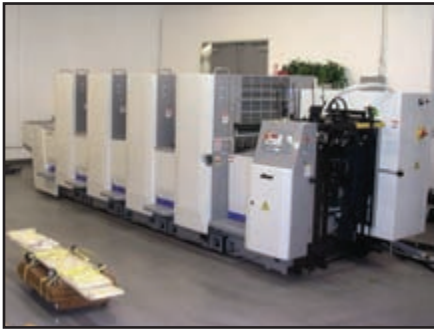
The Sakurai 466SIP 26" Automated Perfector

Four Square Mission Church Chooses Sakurai 466 SIP for new Production Facility in Anaheim, CA