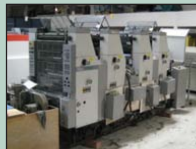
1999 B452A Automated 4-Color 14" x 20" Automated 4-Color with Automated Plate Hangers, Blanket Washers, and Running Register. 28 million impressions.