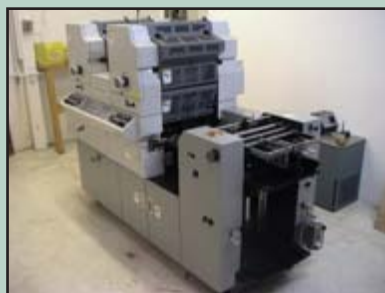
2001 Hamada H234C 13 3/8" x 17 3/4" Two Color Offset Press with Crestline Dampeners, Running Register, Blanket Washers, Powder Spray, and Pin Register System.